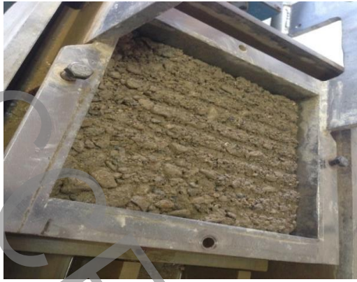
Figure 2. Preparation of the filter materials at the lower half of direct shear box