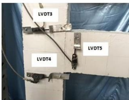
Fig. 2. The details of the LVDTs