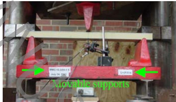
Fig. 2: Three-point bending test on sandwich panels

They plotted the load-displacement curve of 1.5” and 2.5” thick panels under the as shown in Fig.2. Based on the obtained results, they concluded that the behavior of the panel was linear before the initiation of the first crack in the core foam and then became nonlinear afterwards. Finally, it was found that the reason for the failure of all specimens was the rupture of the face sheets.