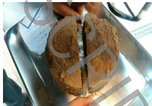
Figure 2. Soil sample

The test mold is 3mm thick, stainless steel and is resistant to water, moisture and pressure. The mold height is 15 cm and 15 cm in diameter (Fig. 2 and 3). After attaching the top piece to the mold, the overall height of the mold reaches 45 cm. At the top of the mold is an embedded faucet from which water is poured onto the sample, as well as a pressure gauge at the top of the mold, which can be used to control the pressure on the sample. The pressure applied by the air pump is connected to the inlet valve of the measuring gauge and its pressure level can be controlled. Below the mold, a funnel is attached to the mold that guides the outlet water centrally to the measuring vessel. One of the benefits of this mold is that the dimensions of the device have been selected so that a suitable workspace can be provided while preparing the specimen and, most importantly, that cracking in the specimen range will not cause any damage until the original test is performed. The outflow of water and pressure is such that at the beginning of the experiment (Fig. 4).