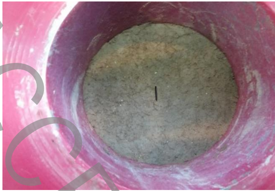
Figure 3. Crack created in samples