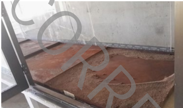
Fig. 1. Wind erosion test of primary soil samples

The soil wind erosion test was carried out after 7 and 30