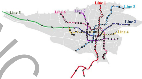
Fig. 1. Subway network of Tehran