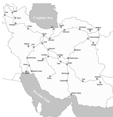
Figure 1: Iran rail network

Focusing on the grouping policies, Table 2 illustrates that the amount of total emission cost significantly decreases by choosing a complete reclassification (i.e., scenarios no. 2, 5, and 8) in comparison with the un-necessary reclassification policies (i.e., scenarios no. 1, 4 and 8).