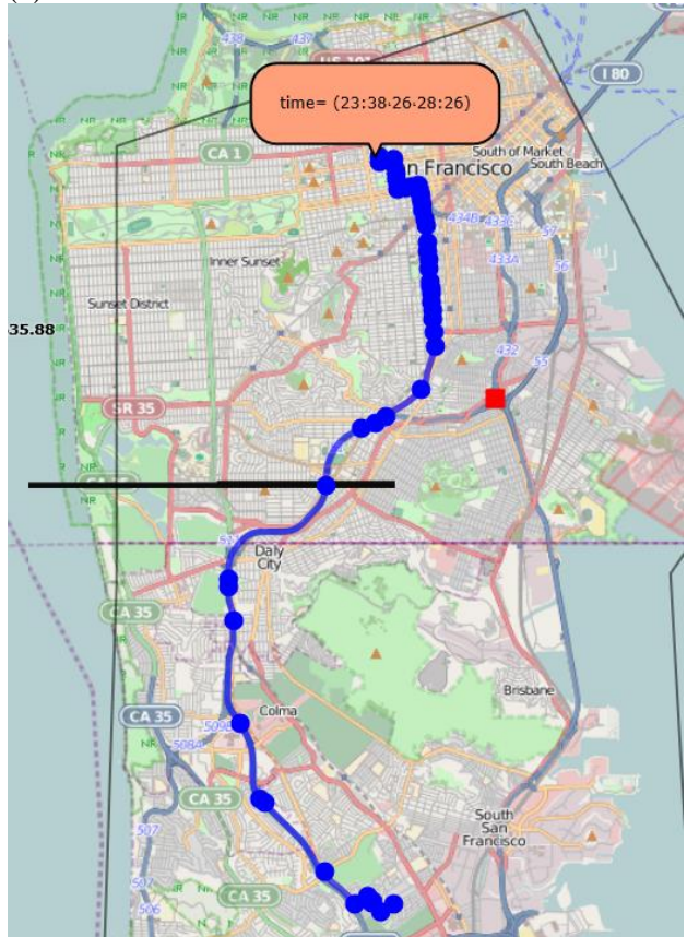
Figure (2): Routing is done by combining historical and real-time data

The result of implementation has been shown in the figure (2).