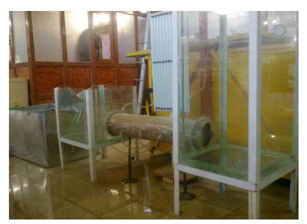
Figure 1: General view of the experimental set-up used in this study

Packed column test components consisted of 5 whole parts including upstream tank, downstream tank, packed bed; piezometric board and measurement chamber of the flow rate (see Figure 1). The dimensions of upstream tank are 1 m \times 0.50 \text{ m} \times 0.50 \text{ m} and are made of glass which was placed inside a metal frame and also the dimensions of downstream tank are 0.50 m \times 0.50 cm \times 0.50 cm. The internal diameter of cylinder containing materials is 0.20 m and its length is 1 m. The packed bed was filled with selected granular materials and uniformly compacted. The packed column was then connected to two water tanks of adjustable levels at each end. By adjusting water levels in the upper tank, various flow rates and hydraulic gradients were established. Measurements were carried out after a steady state of flow was reached; in total 6 hours time was spent for each experiments (reading piezometric board and measuring seepage discharge). Scaled piezometric board was composed of 10 clear tubes tabs. Due to large grain sizes and voids, air bubbles exit through piezometers and water level in piezometers became stable after a short time. Finally, volumetric seepage discharge and piezometric pressures were measured at different time intervals and averaged for subsequent analyses (Figure 2).