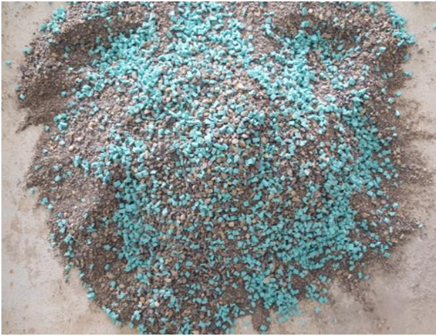
Fig. 1. The mixture of soil and EVA material