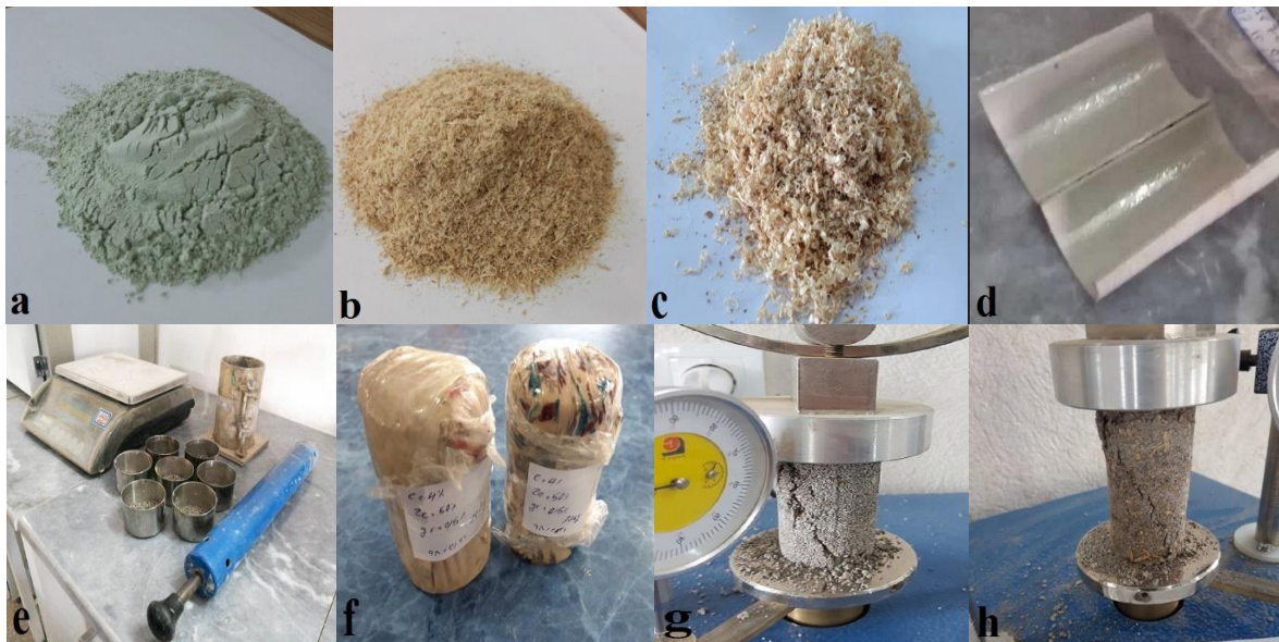
Fig. 1. making samples steps - a) zeolite, b) powdered sawdust, c) fibrous sawdust, d) PVC mold, e) compaction test equipment, f) samples' curing process, g) powdered sawdust sample at the moment of rupture, h) fibrous sawdust samples at the moment of rupture