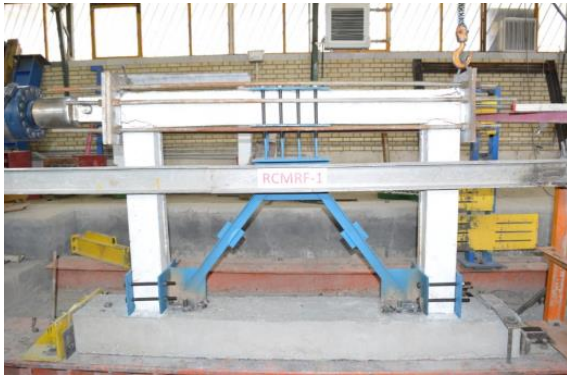
Fig. 3. The model with the proposed damper in a concrete moment frame