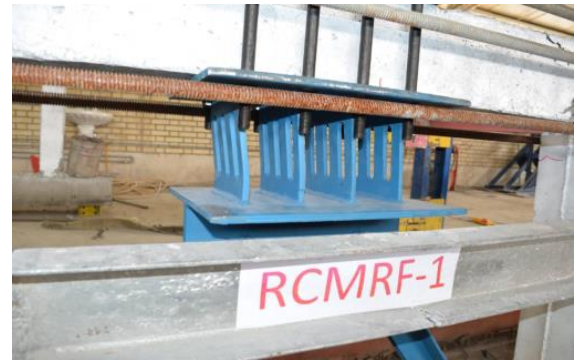
Fig. 4. Image of the damper used in the present study