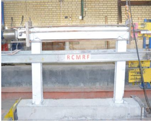
Fig. 1. Model of concrete frame structure without damper