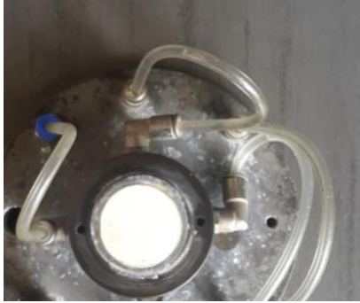
Fig. 3. Variation of CRR20 with the degree of saturation for used Firoozkooch sands