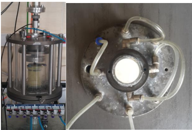
Fig. 1. Unsaturated triaxial chamber and ceramic disk on the bottom pedestal