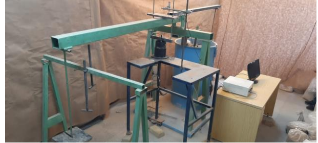
Figure 1. Apparatus with the ability to simulate the pattern of water infiltration

Due to the limitations of the existing experiments, an apparatus was prepared that has the ability to simulate various types of water infiltration in the soil. According to "Figure 1", the apparatus consists of three parts, including the loading system, the sample cell and the system for measuring and recording displacements.