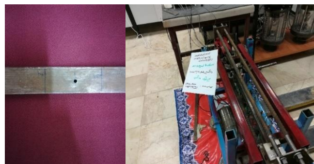
Fig. 2. Laboratory equipment