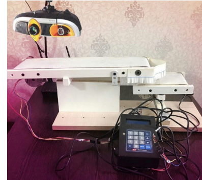
Figure 2. A view of the device and its various parts

mineral was first processed by a 3D scanner (nub3d-made in Germany) and draw mineral clouds. The minerals volume was extracted using the CAD program attached to the processor. After this step, the PLC system assigned a code to each of the mineral and record its volume. Then the minerals crossed the conveyor belt in line, and each mass was determined.